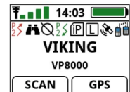
Day - High Contrast