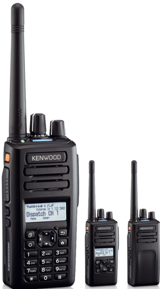
Full Keypad Model